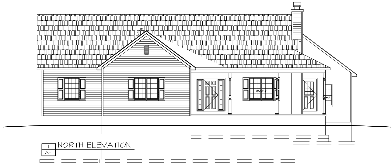
1 NORTH ELEVATION A-1